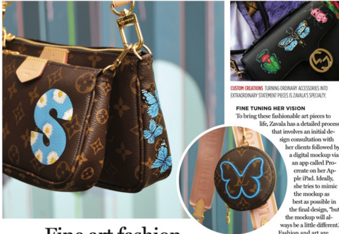
CUSTOM CREATIONS TURNING ORDINARY ACCESSORIES INTO EXTRAORDINARY STATEMENT PIECES IS ZAVALA'S SPECIALTY.